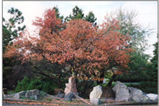
Allegheny Serviceberry in fall

* This is a 'special order' plant - contact store for details