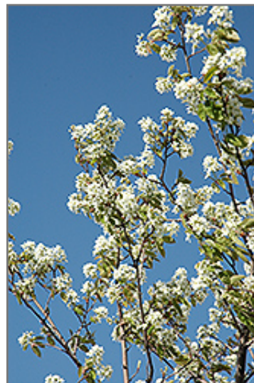
Allegheny Serviceberry flowers