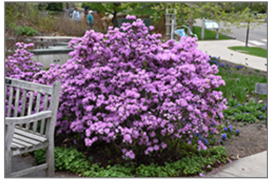
P.J.M. Rhododendron in bloom

P.J.M. Rhododendron is recommended for the following landscape applications;