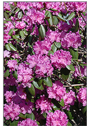
P.J.M. Rhododendron flowers