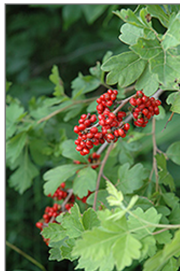
Fragrant Sumac fruit

Fragrant Sumac is recommended for the following landscape applications;