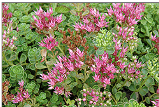
John Creech Stonecrop flowers

John Creech Stonecrop is recommended for the following landscape applications;