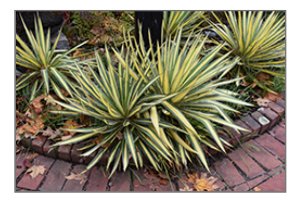
Color Guard Adam's Needle

Color Guard Adam's Needle is recommended for the following landscape applications;