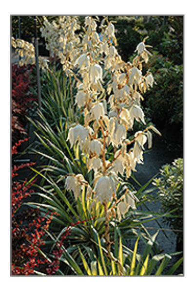
Color Guard Adam's Needle in bloom

85 CHIEF JUSTICE CUSHING HWY SCITUATE, MA 02066 781-545-1266 www.kennedyscountrygardens.com