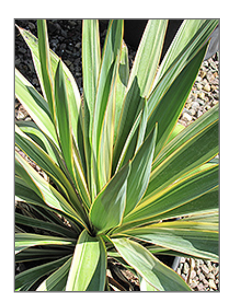
Color Guard Adam's Needle

This shrub should only be grown in full sunlight. It prefers dry to average moisture levels with very well-drained soil, and will often die in standing water. It is considered to be drought-tolerant, and thus makes an ideal choice for a low-water garden or xeriscape application. It is not particular as to soil type or pH. It is somewhat tolerant of urban pollution. This is a selection of a native North American species.