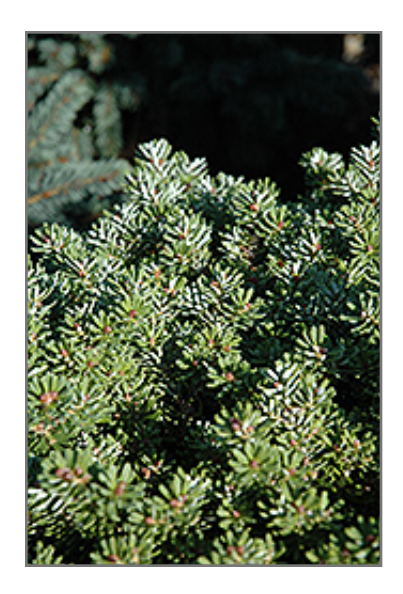
Silberperle Korean Fir foliage

85 CHIEF JUSTICE CUSHING HWY SCITUATE, MA 02066 781-545-1266 www.kennedyscountrygardens.com