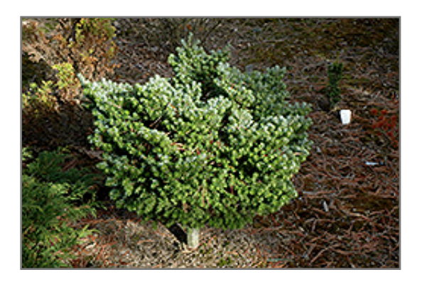
Silberperle Korean Fir

Silberperle Korean Fir is recommended for the following landscape applications;