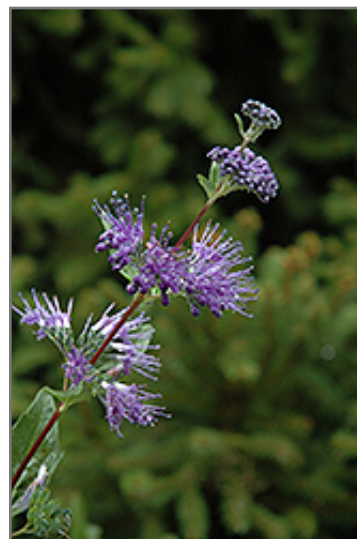
Blue Mist Caryopteris flowers

Blue Mist Caryopteris is recommended for the following landscape applications;