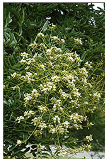
Japanese Pagoda Tree flowers