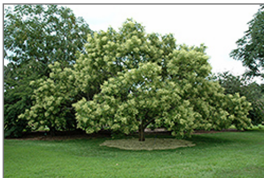
Japanese Pagoda Tree in bloom

Japanese Pagoda Tree is recommended for the following landscape applications;