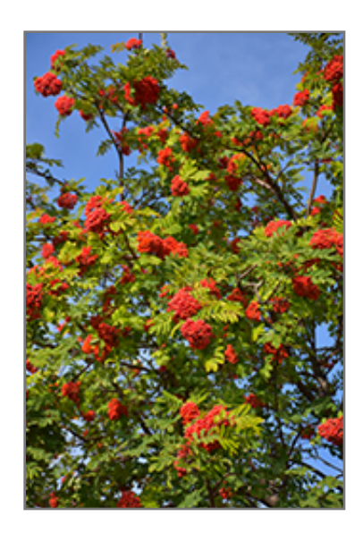
European Mountain Ash fruit

85 CHIEF JUSTICE CUSHING HWY SCITUATE, MA 02066 781-545-1266 www.kennedyscountrygardens.com