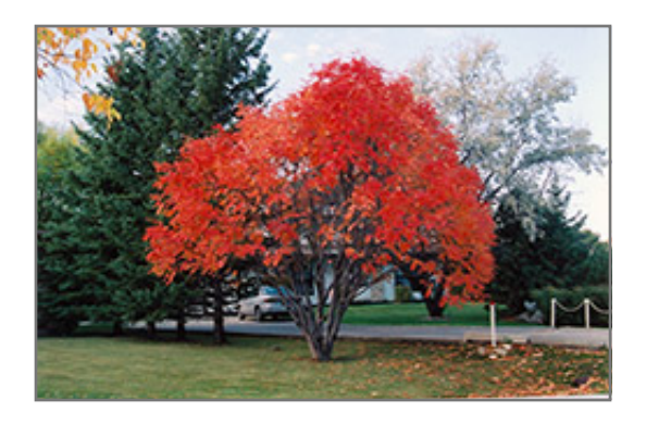
European Mountain Ash in fall

European Mountain Ash is recommended for the following landscape applications;