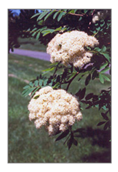
European Mountain Ash flowers

* This is a 'special order' plant - contact store for details