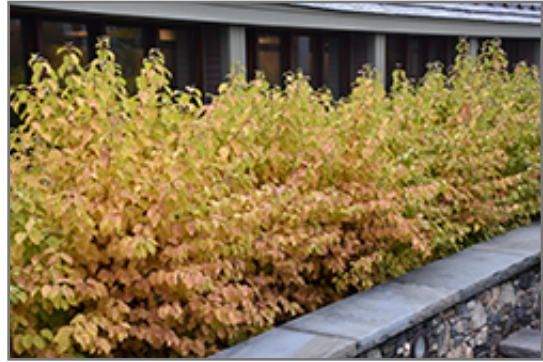
Midwinter Fire Dogwood in fall