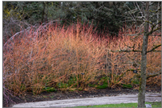
Midwinter Fire Dogwood in winter