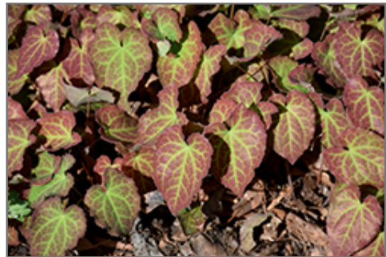
Froehnleiten Bishop's Hat foliage