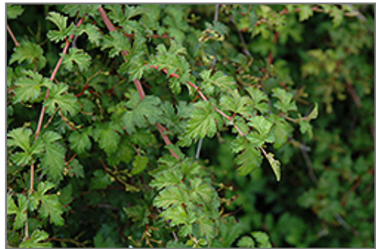
Cutleaf Stephanandra foliage