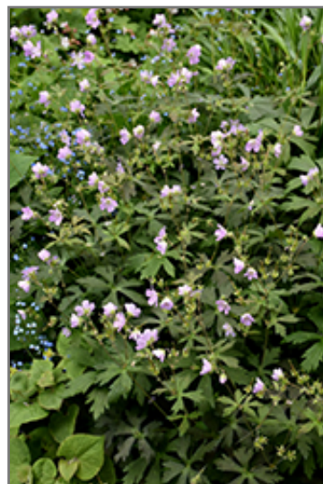
Espresso Cranesbill in bloom

* This is a 'special order' plant - contact store for details