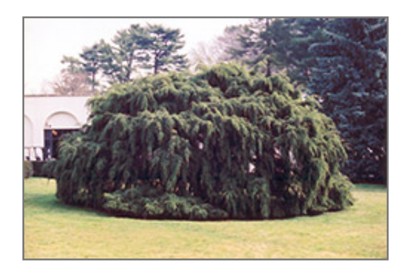
Weeping Hemlock

85 CHIEF JUSTICE CUSHING HWY SCITUATE, MA 02066 781-545-1266 www.kennedyscountrygardens.com