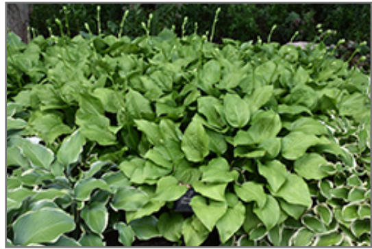
Royal Standard Hosta

Royal Standard Hosta is recommended for the following landscape applications;