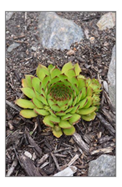
Sunset Hens And Chicks