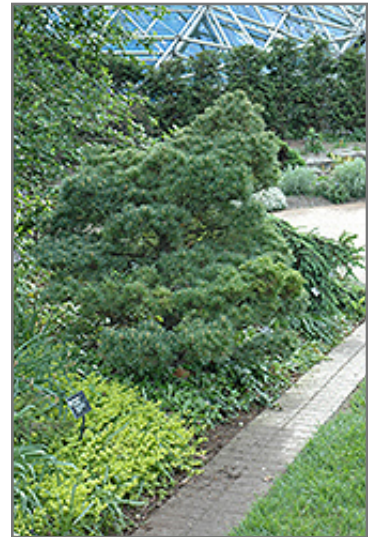
Macopin Eastern White Pine

* This is a 'special order' plant - contact store for details