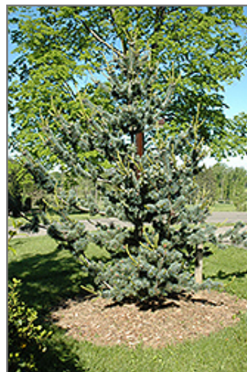
Short-Needled Japanese Blue Pine