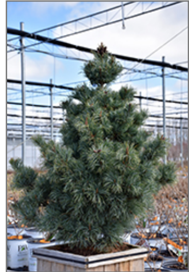
Bergman Japanese White Pine

* This is a 'special order' plant - contact store for details