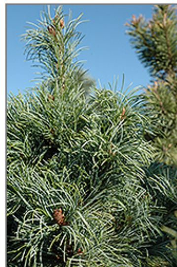
Bergman Japanese White Pine foliage