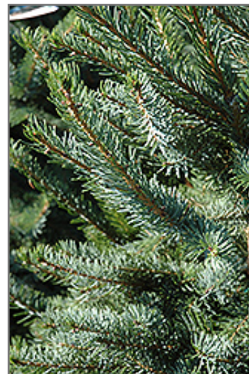
Bruns Spruce foliage