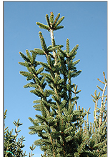
Columnar Norway Spruce foliage