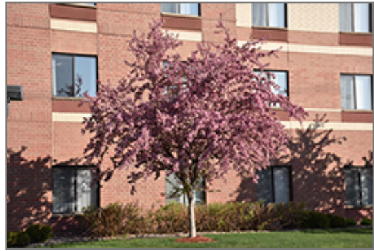
Robinson Flowering Crab in bloom

Robinson Flowering Crab is recommended for the following landscape applications;