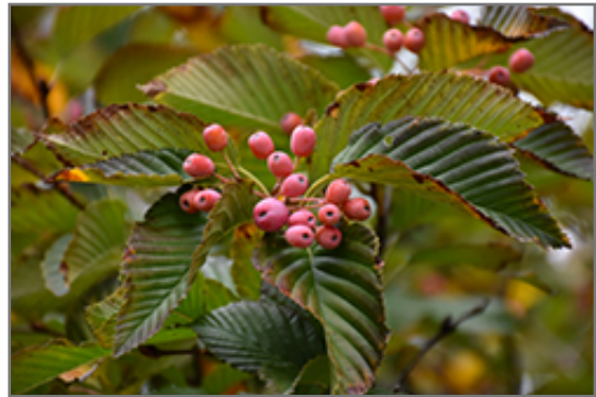
Korean Mountain Ash fruit