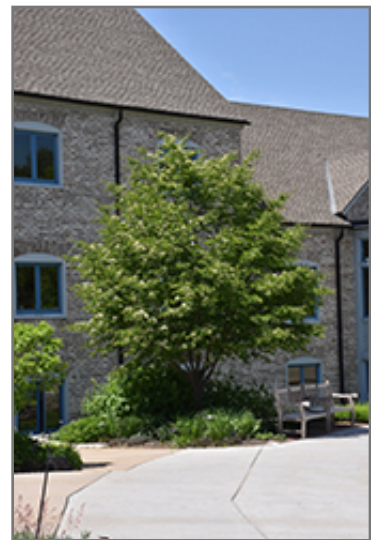
Korean Mountain Ash in bloom