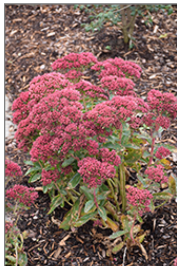
Munstead Dark Red Stonecrop in bloom