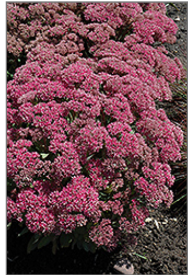
Mr. Goodbud Stonecrop flowers

Mr. Goodbud Stonecrop is recommended for the following landscape applications;