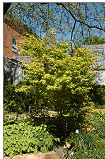
Coral Bark Japanese Maple