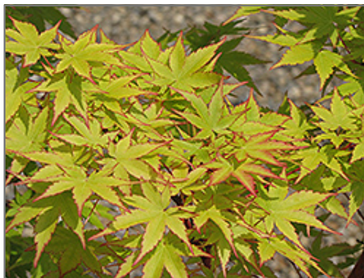
Coral Bark Japanese Maple foliage

Coral Bark Japanese Maple is recommended for the following landscape applications;