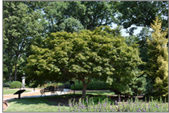
Trompenburg Japanese Maple

* This is a 'special order' plant - contact store for details