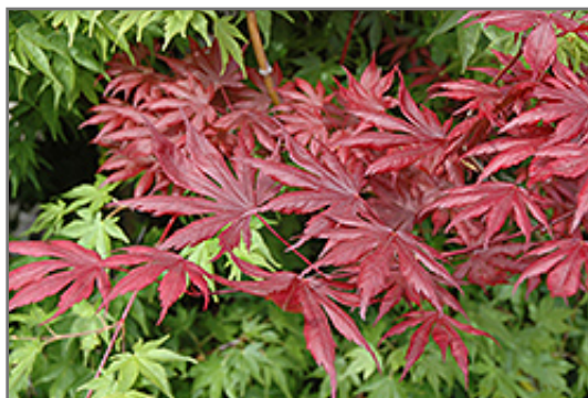
Trompenburg Japanese Maple foliage

This is a relatively low maintenance tree, and should only be pruned in summer after the leaves have fully developed, as it may 'bleed' sap if pruned in late winter or early spring. It has no significant negative characteristics.