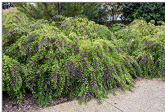
Issai Beautyberry fruit