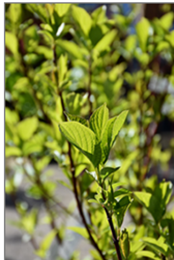
Bailey Red-Twig Dogwood foliage

* This is a 'special order' plant - contact store for details