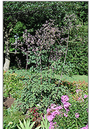
Rochebrun Meadow Rue in bloom