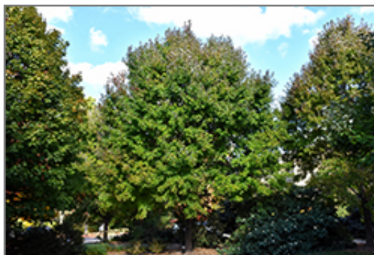
Autumn Flame Red Maple

This tree should only be grown in full sunlight. It is quite adaptable, preferring to grow in average to wet conditions, and will even tolerate some standing water. It is not particular as to soil type, but has a definite preference for acidic soils, and is subject to chlorosis (yellowing) of the foliage in alkaline soils. It is somewhat tolerant of urban pollution. This is a selection of a native North American species.