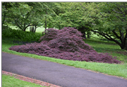
Garnet Cutleaf Japanese Maple