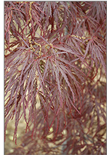
Garnet Cutleaf Japanese Maple foliage

Garnet Cutleaf Japanese Maple is recommended for the following landscape applications;