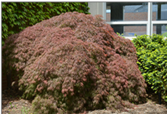
Red Select Japanese Maple

* This is a 'special order' plant - contact store for details