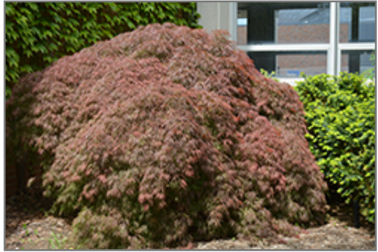
Red Select Japanese Maple

* This is a 'special order' plant - contact store for details