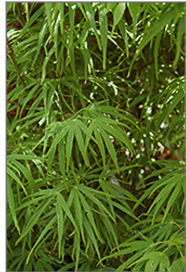
Scolopendrifolium Japanese Maple foliage

Scolopendrifolium Japanese Maple is recommended for the following landscape applications;