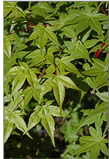
Shindeshojo Japanese Maple foliage

Shindeshojo Japanese Maple is recommended for the following landscape applications;