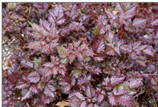
Delft Lace Astilbe foliage

Delft Lace Astilbe will grow to be about 16 inches tall at maturity extending to 24 inches tall with the flowers, with a spread of 12 inches. When grown in masses or used as a bedding plant, individual plants should be spaced approximately 12 inches apart. Its foliage tends to remain dense right to the ground, not requiring facer plants in front. It grows at a medium rate, and under ideal conditions can be expected to live for approximately 10 years. As an herbaceous perennial, this plant will usually die back to the crown each winter, and will regrow from the base each spring. Be careful not to disturb the crown in late winter when it may not be readily seen!