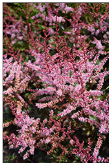
Delft Lace Astilbe flowers

This is a relatively low maintenance plant, and is best cleaned up in early spring before it resumes active growth for the season. It is a good choice for attracting butterflies to your yard, but is not particularly attractive to deer who tend to leave it alone in favor of tastier treats. It has no significant negative characteristics.