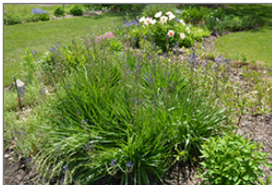
Blue Danube Camassia in bloom