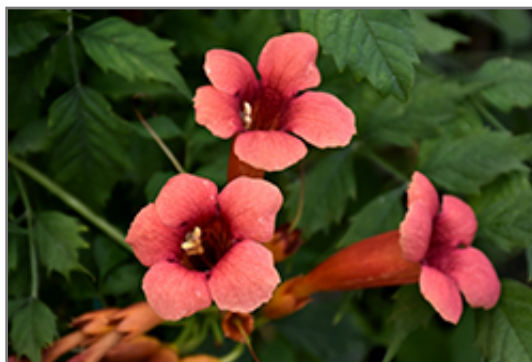
Flamenco Trumpetvine flowers