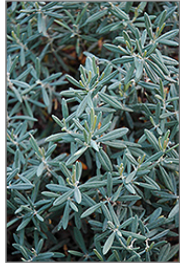
Blue Ice Bog Rosemary foliage

* This is a 'special order' plant - contact store for details