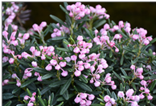
Blue Ice Bog Rosemary flowers