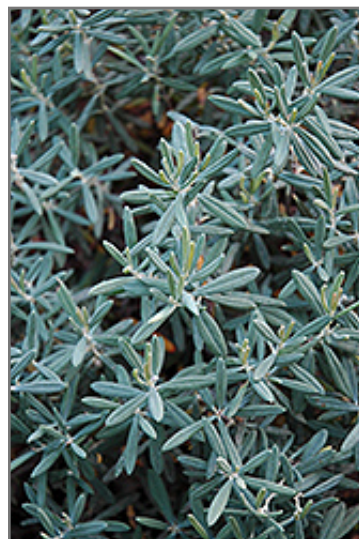
Blue Ice Bog Rosemary foliage

* This is a 'special order' plant - contact store for details