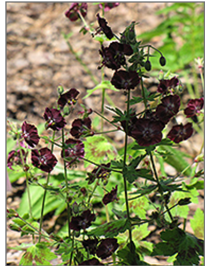
Samobor Cranesbill in bloom

Samobor Cranesbill is recommended for the following landscape applications;