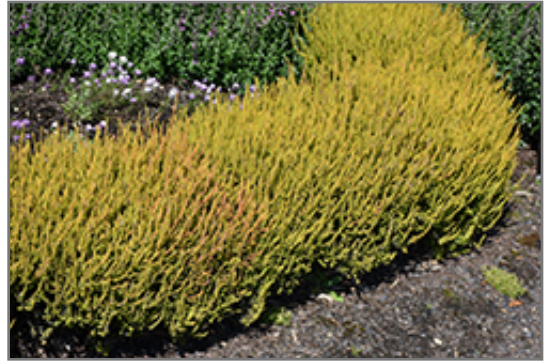
Firefly Heather

* This is a 'special order' plant - contact store for details