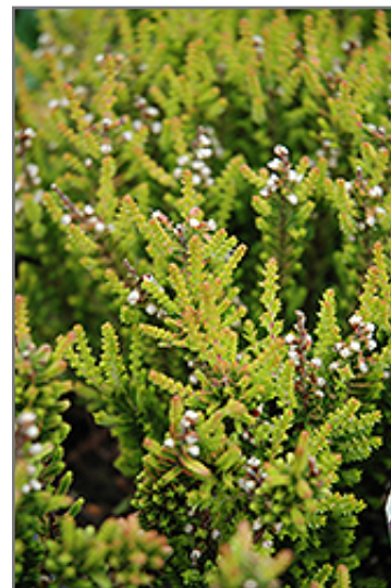
Firefly Heather foliage