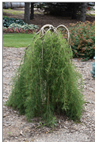
Walker Weeping Peashrub

* This is a 'special order' plant - contact store for details