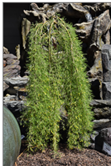
Walker Weeping Peashrub

Walker Weeping Peashrub is recommended for the following landscape applications;