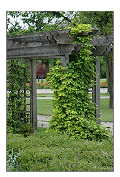
Nugget Ornamental Golden Hops