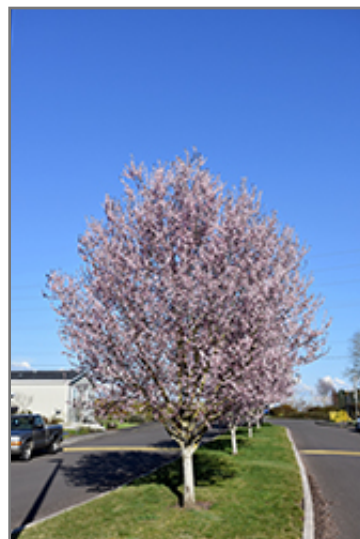
Krauter Vesuvius Plum in bloom