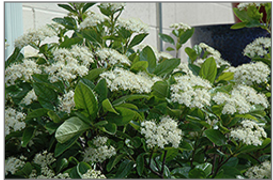
Winterthur Viburnum flowers

This is a relatively low maintenance shrub, and should only be pruned after flowering to avoid removing any of the current season's flowers. It is a good choice for attracting birds to your yard, but is not particularly attractive to deer who tend to leave it alone in favor of tastier treats. It has no significant negative characteristics.