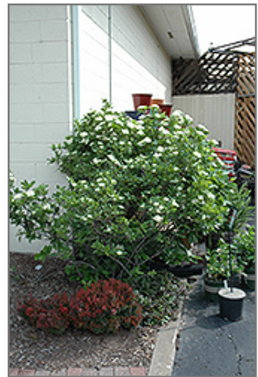
Winterthur Viburnum in bloom