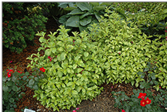
Ghost Weigela

* This is a 'special order' plant - contact store for details