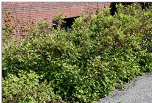
Shrub Yellowroot