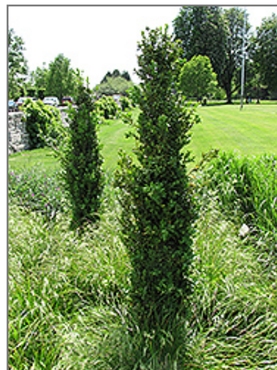
Graham Blandy Boxwood