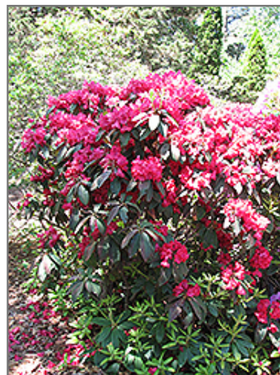
Trilby Rhododendron in bloom