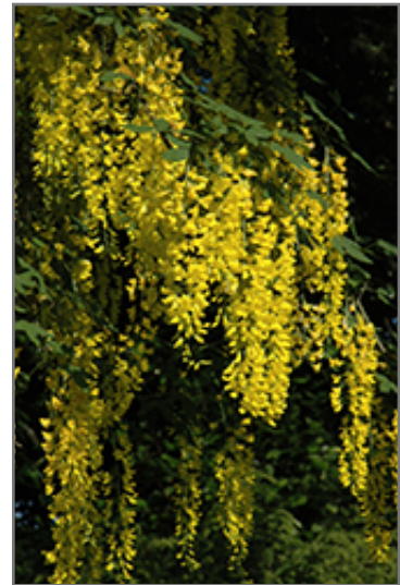
Weeping Laburnum flowers